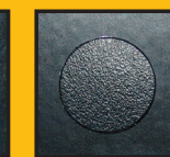
Capped with 9/16" Fastcap